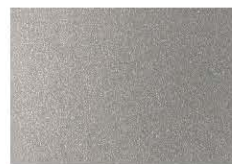
Pre Weathered Galvalume 2,4 TSR: 34 • E: 0.75 • SRI: 31