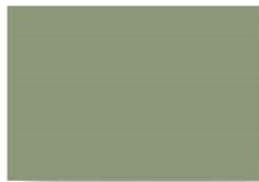
Patina Green 4 TSR: 39 • E: 0.83 • SRI: 41