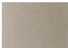
Champagne Metallic 2,4 TSR: 43 • E: 0.78 • SRI: 44