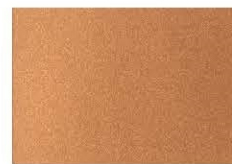
Copper Metallic 2,4 TSR: 45 • E: 0.87 • SRI: 51