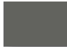
Charcoal Grey TSR: 29 • E: 0.84 • SRI: 28