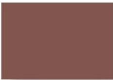
L.G. Colonial Red 4 TSR: 28 • E: 0.89 • SRI: 29