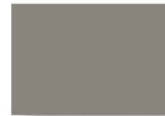
Slate Grey 4 TSR: 36 • E: 0.82 • SRI: 37