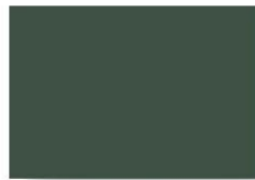
Hartford Green TSR: 31 • E: 0.83 • SRI: 30