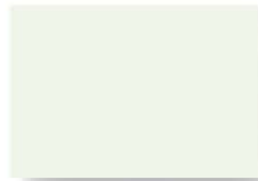
Regal White 4 TSR: 70 • E: 0.86 • SRI: 85