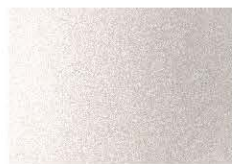
Silver Metallic 2,4 TSR: 55 • E: 0.71 • SRI: 59